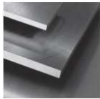
$mart Flat Stock [$mart] Standardized Precision Blanks L: 12" L: 24"