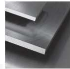
$mart Flat Stock Metric [$martM] Standardized Precision Blanks Metric L: 300 mm L: 600 mm