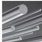
Precision round steel with machining allowance [PRS/BA] peeled / rough-turned L: 500 mm L: 1.000 mm