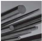
Round steel [RS] black L: 500 mm L: 1.000 mm