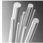
Round aluminium [RA] pressed L: 500 mm L: 1,000 mm